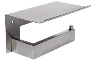
AI2005CS Satin finish