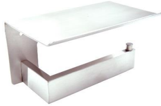
AI2005C Bright finish