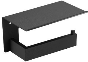
AI2005B Black finish